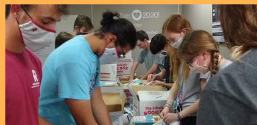
Rose-Hulman student volunteers assembling books for school delivery

In 2021, United Way of the Wabash Valley completed the final year of our announced three-year transition period that pivoted the organization from annual funding of “Member Agencies” to a collaborative approach to invest donor resources in our full slate of active Impact Councils. These councils will now focus all donor investments on targeted solutions to critical issues that contribute to 40% of our population struggling financially each day. The 2021 Financial Outlook confirms that donors and state, federal and endowment grantors are pleased with our results. For a second straight year, through a diversified resource stream, United Way has been able to grow overall revenue well above the traditional “Annual Campaign”. This has led to increasing programming investments in our 6-county area, achieving the highest 2-year total (2020 and 2021) since 2004 & 2005—more than 15 years ago.