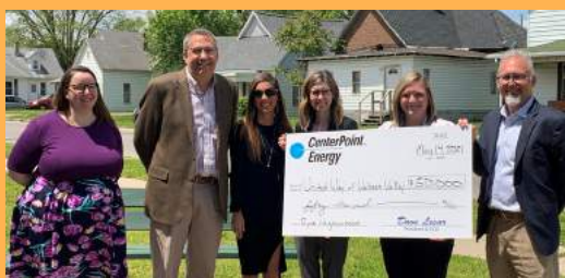
CenterPoint Energy awarding United Way $50,000 for their Strong Neighborhoods Council