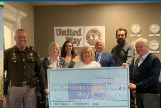
United Way Substance Use Council presents a check to the Vigo County Juvenile Justice Center