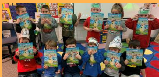
Classroom receiving their Real Men Read books

*Audited financials are available at uwwv.org